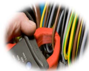
Electrical Maintenance & Fitters